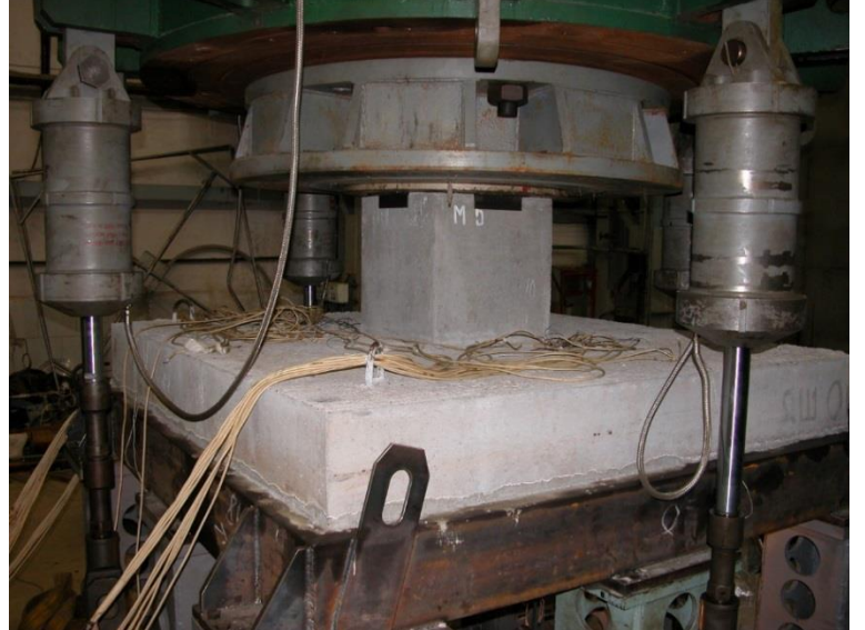
a) sample on the bench, side view