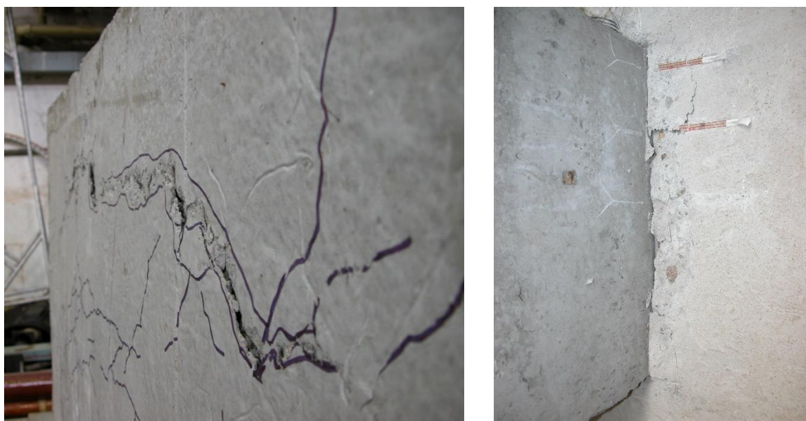
a) ring crack on the lower the slab face b) column cracks and spalls Figure 5. Cracks characterizing the punching pyramid