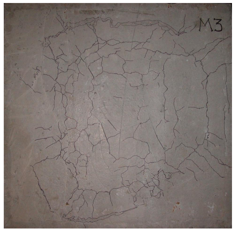
Figure 3. Lower (tension) slab face

The values of the normal crack opening width, obtained experimentally (according to an electron microscope) and analytically (according to relative reinforcement deformations) and given in Table 3, significantly differ only at the first punching stage; further, the obtained results show satisfactory convergence.