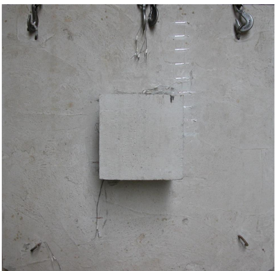
Figure 4. Upper (compression) slab face