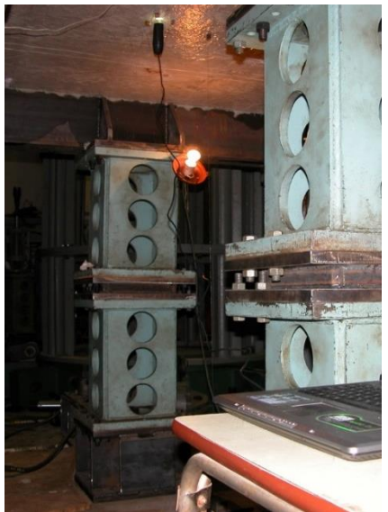
b) sample on the bench, view from below